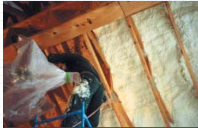
Icynene® is sprayed directly on to the roof deck. There are no air vent channels.

The remaining portion of the attic floor space, approximately 576 sq. ft., was left intact with the original R40 fiberglass batt insulation.