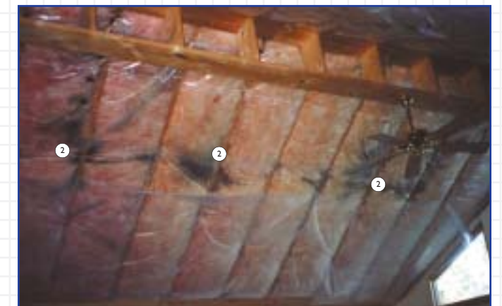
(2) Hot humid interior air had leaked past the poly, through the batt insulation, and come into contact with the cold air in the venting, thus causing condensation and mold.