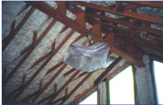
Icynene® is sprayed to a depth of 5 1/2 inches and adheres directly to the roof deck.