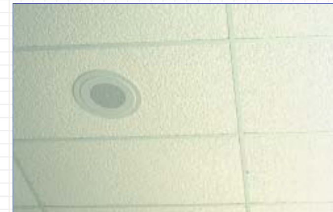
One year after the Icynene® insulation had been installed above these ceiling tiles – no more water damage.

There has been no condensation in the area under the chillers and walk-in freezers where The Icynene Insulation System® had been applied.