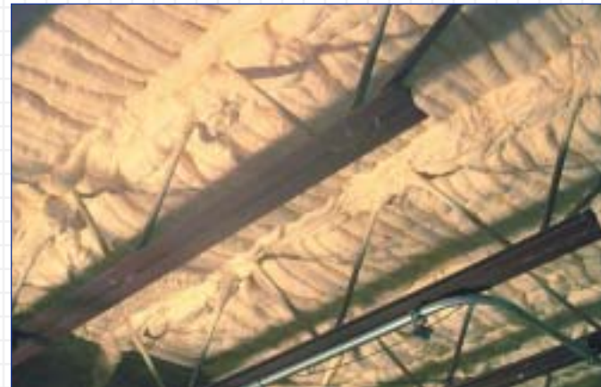
Area of application for Icynene® included the footprint of the chillers and walk-in freezers plus a perimeter area extending 10 feet beyond.