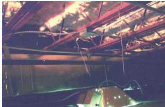
Icynene® insulation applied directly to the metal ceiling area below the chillers and walk-in freezers.

Sprayseal concluded that to prevent the formation of condensation on the metal ceiling deck, 3 inches of The Icynene Insulation System® would be applied directly to the affected area. One ceiling tile at a time was removed to provide access to the area between the dropped ceiling and the metal decking. Icynene® insulation was then applied directly to the metal decking, with the area below protected from over-spray by the remaining ceiling tiles. This spraying process was repeated until the entire area that had been producing condensation was covered.