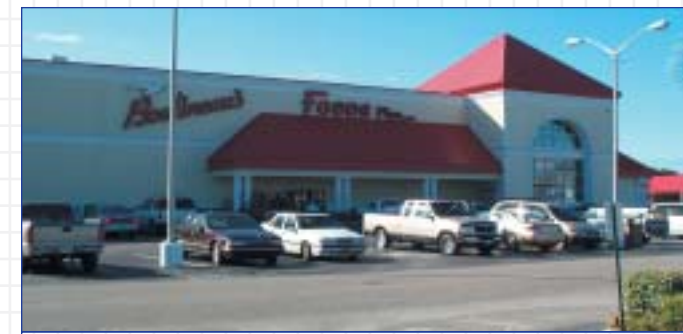
Boulineau's Grocery & Department store, Myrtle Beach, South Carolina.

Boulineau's is a quality grocery and department store located in the resort area of North Myrtle Beach, South Carolina. In this hot, humid climate, the design cooling temperature is 92 degrees and summertime relative humidity levels often reach 90% and higher.